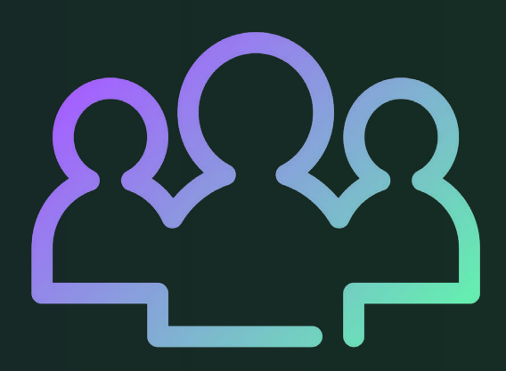
Increasing challenge to maintain due to staff turnover & knowledge decay.