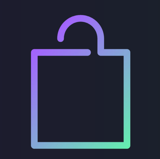
Data is inaccessible/ value is locked into structured formats.