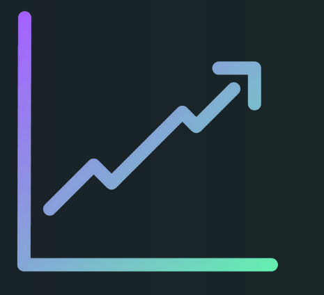
TCO is too high/ cost & value are not aligned.