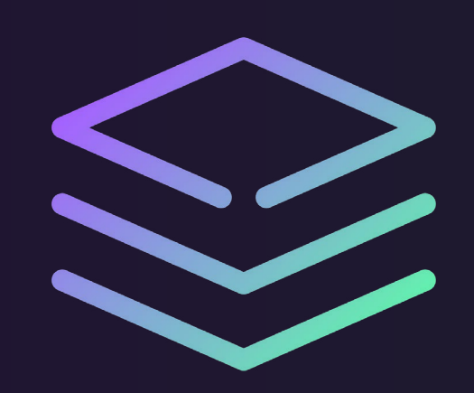
Limitations of underlying infra impede performance & scale.